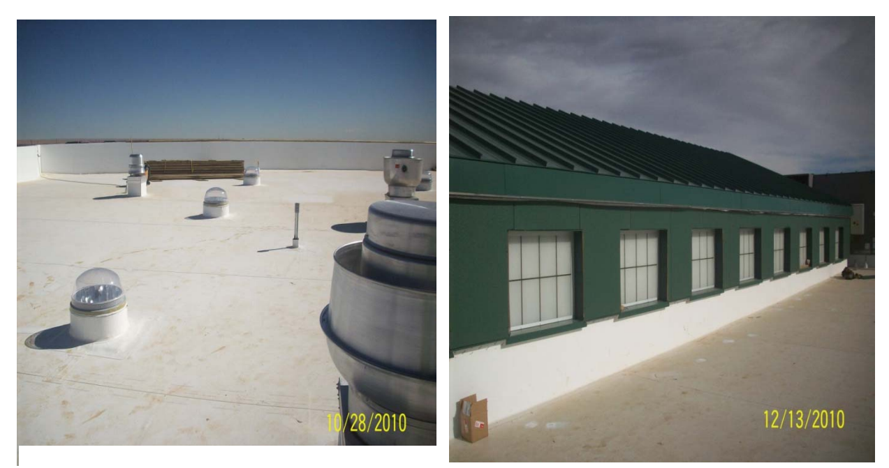
Figure 1 . – Left is an example of a fully adhered TPO membrane roof system. On the right, a standing seam metal roofing system.