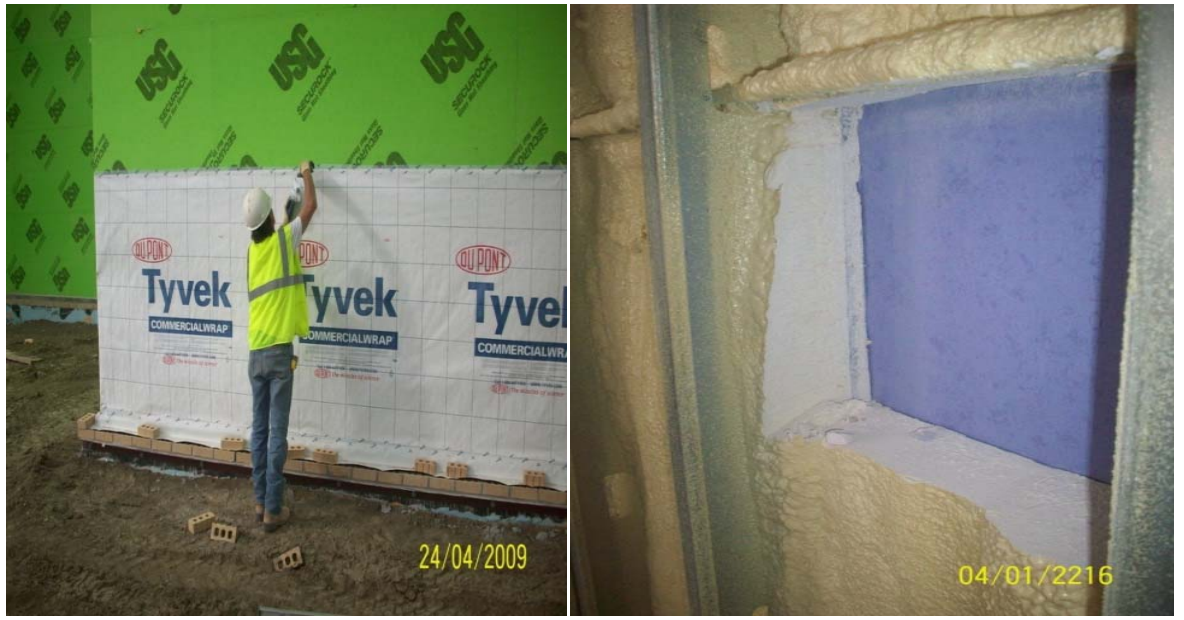
Figure 5: These are examples of the four most common air water and vapor control layer materials. (Top) A fluid applied membrane material and a self adhered membrane functioning as the thru-wall flashing at the mud-sill. (Bottom left) A common mechanically fastened sheet film building wrap product. (Bottom Right) A cut out section of a closed cell spray applied foam applied to the interior cavity of the exterior wall assembly.