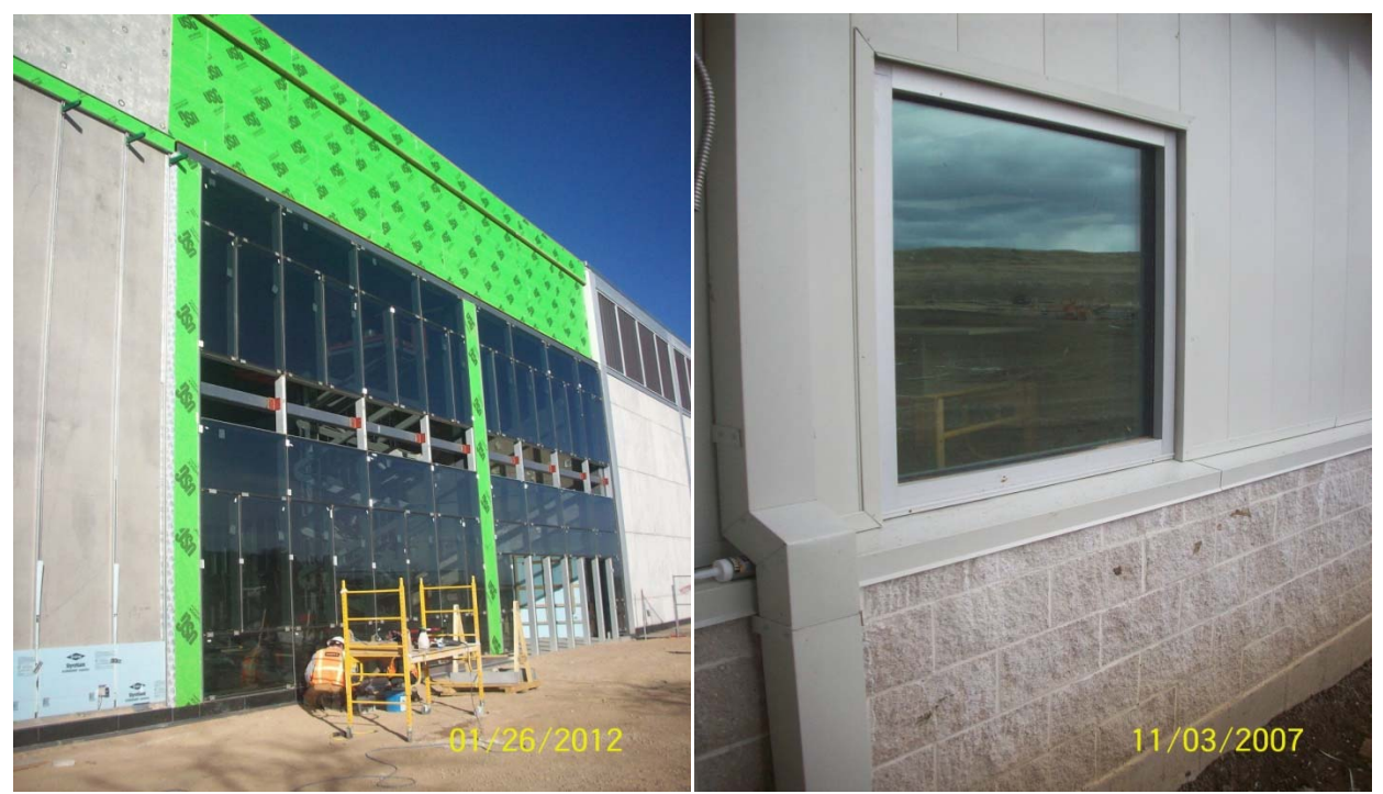
Figure 2: (Left) is an example of a large curtain wall assembly commonly seen in construction applications. (Right) a small fixed aluminum frame window.

e. Visible Transmittance- the percentage of visible light that passes through a window or material.