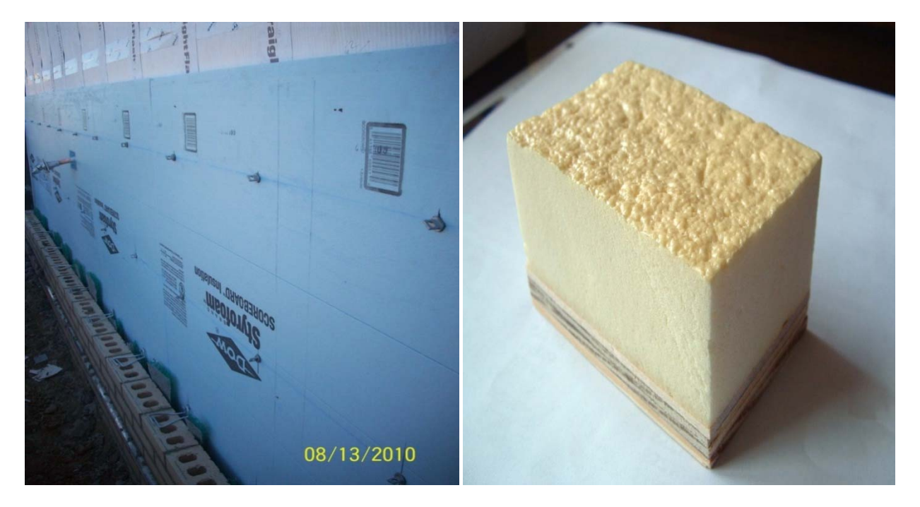
Figure 4: (Left) This installation of the exterior insulation board in this figure is of high quality. Note the boards and joints between them are tight with no large gaps present. Brick ties shown in this installation to are not interfering with the continuity of the insulation and are actually designed to double as fasteners for the insulation boards to the substrate. (Right) An example of a closed cell spray foam insulation material.